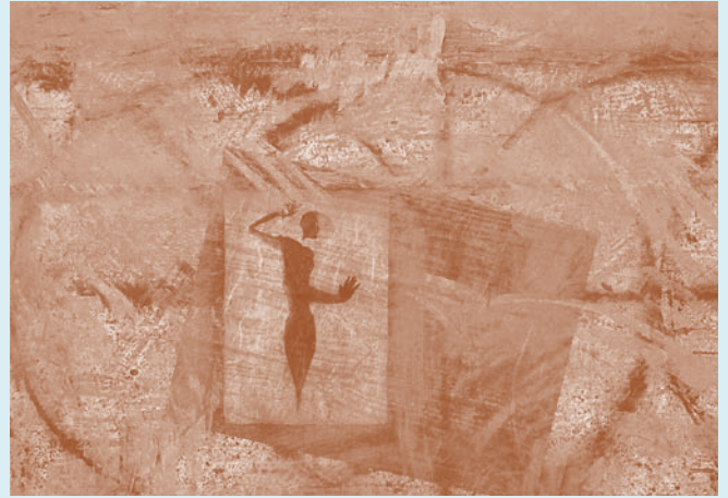
"Shadow Man 2", by Donald Depuydt, Intaglio/Collagraph, 22" x 33"

Printmakers Depuydt and Nelson will exhibit a body of work contrasting images in the Caton Merchant Family Gallery from August 3-September 14, 2009. Gallery hours are 10:00-5:00 weekdays and from 1:00-5:00 on Saturdays.